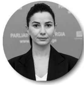
Mariam Kvrivishvili Member of the Parliament of Georgia , Member of Committees on European Integration and Economic Policies