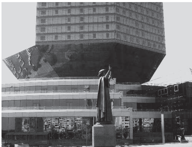
The new building of the National Library of Belarus